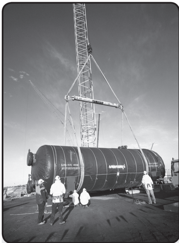
The first DMPF is delivered to site

The first mechanical components have also been installed on site. These are the components that make the desalination process tick, and include the first of 72 huge dual media pressure filters (DMPFs) which will filter out small particles of sand and sediment from seawater before it passes through the desalination process.