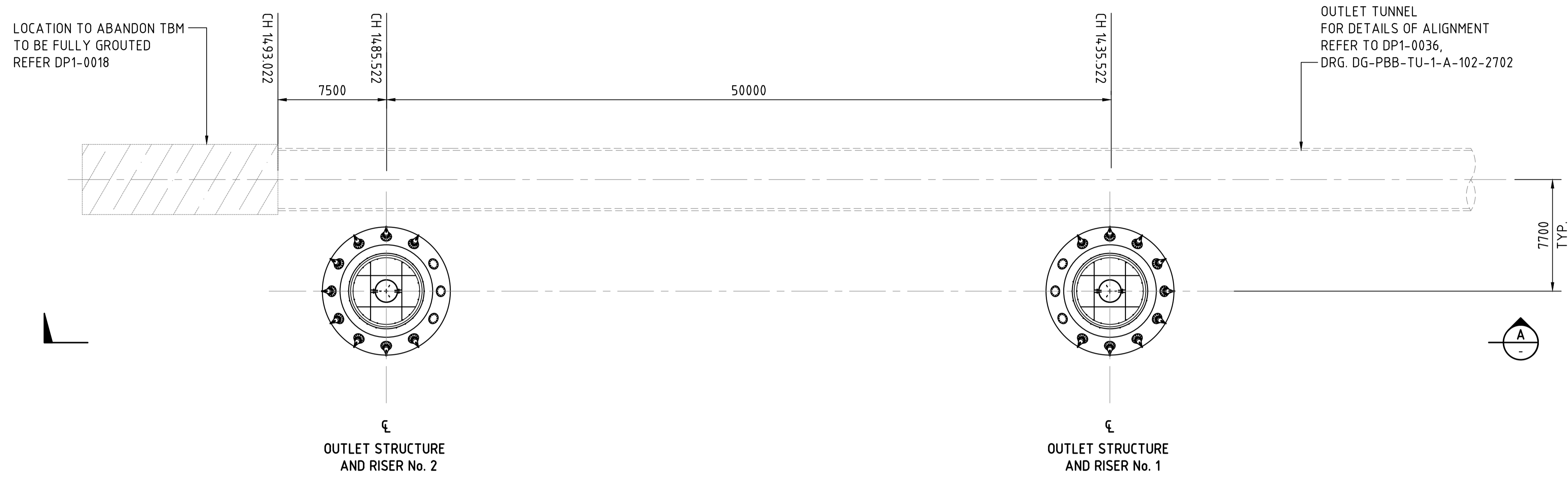
OUTLET STRUCTURE AND RISERS - GENERAL ARRANGEMENT SCALE 1:200