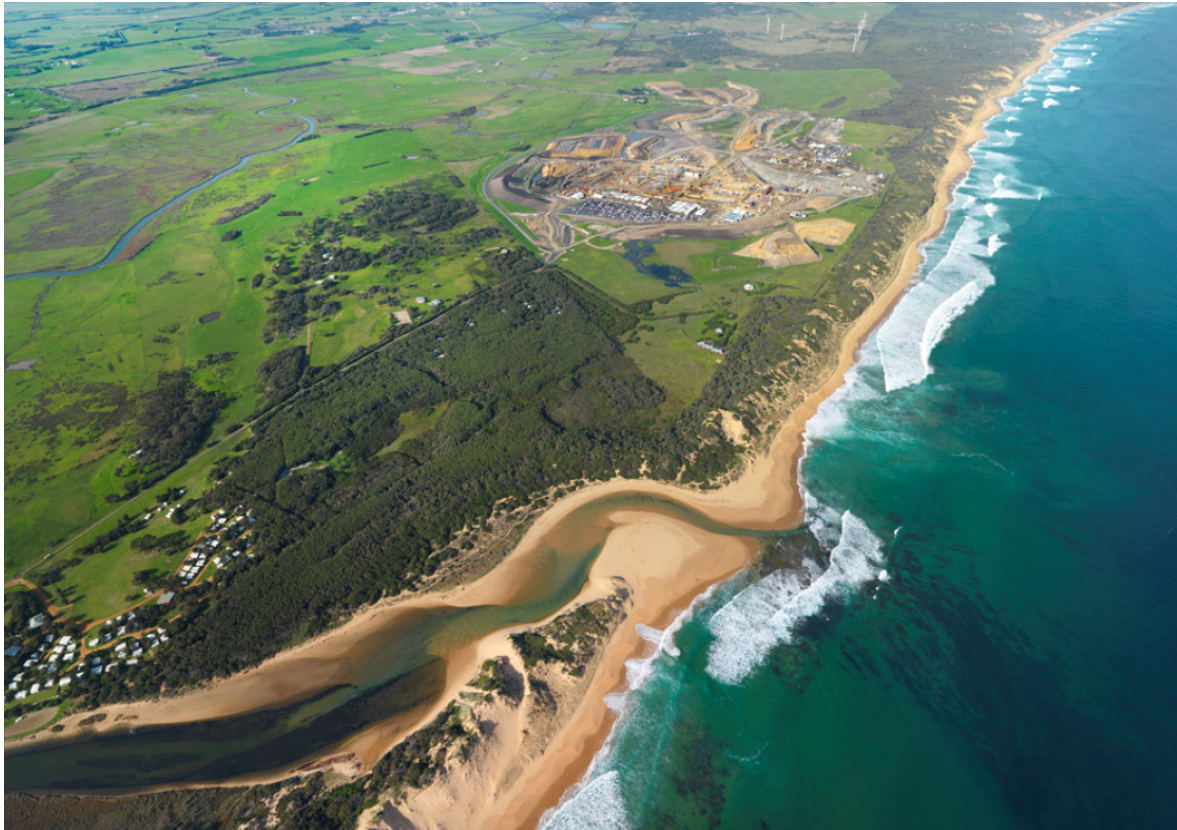
Figure 4-1. Coastline adjacent to the project area showing the plant site under construction in June 2010 and the Powlett River in the foreground.

General location of activities in relation to the coast can be found in Attachment B – Project Components. A photograph of the coastal area applicable to this sub plan is given in Figure 4-1 below.