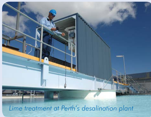
Lime treatment at Perth's desalination plant

It uses the same desalination technology and the same treatment processes that are being used at Victoria's new desalination plant.